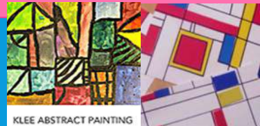
KLEE ABSTRACT PAINTING