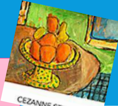
CEZANNE STILL LIFE