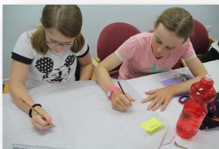
Year 7 Maths working hard.