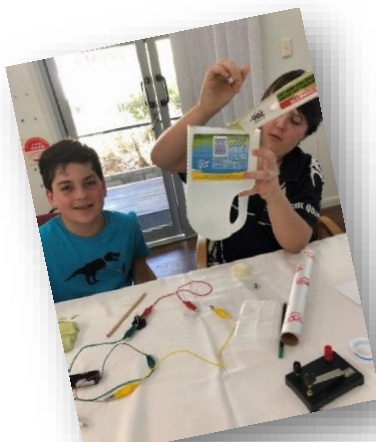
Year 8 Experience Design Tech.